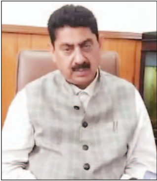
AGENCY SHIMLA, OCT 19

The BJP on Wednesday released its first list of 62 candidates for the polls to the 68-member Himachal Pradesh assembly, fielding Chief Minister Jai Ram Thakur from his current constituency Seraj.