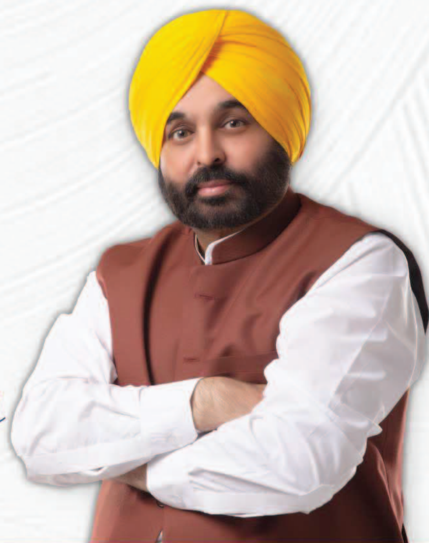
Bhagwant Mann Chief Minister, Punjab