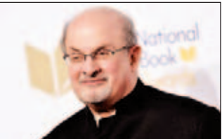
SHIMLA, NOV 25

YUGMARG, CHANDIGARH, SATURDAY, NOVEMBER 26, 2022