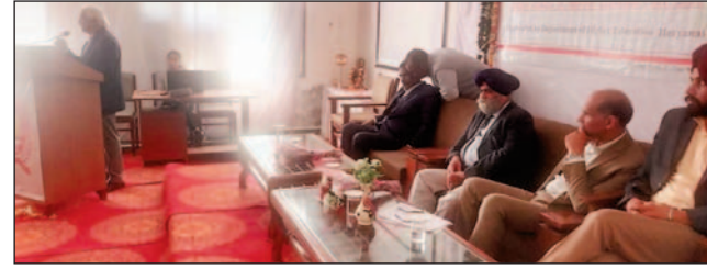
NIRMAL RADAUR, FEB 16