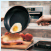
that helps it deliver a superior non-stick performance free of harmful chemicals such as PFOAs, Lead, or Cadmium.