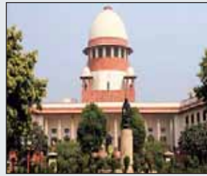
Manipur violence: SC seeks fresh status report on security measures