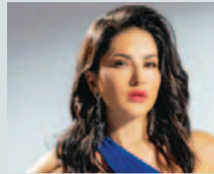
Sunny Leone gears up to debut in style on Cannes red carpet