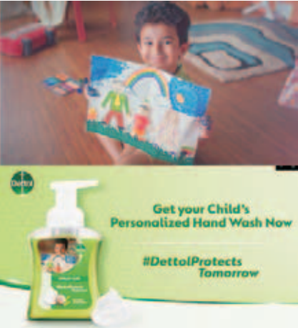
their natural curiosity, without any fear of germs. Dettol Foaming handwash provides 10x better

#DettolProtectsTomorrow, and the inspirational stories of these children, we want to empower mothers to encourage their children to pursue