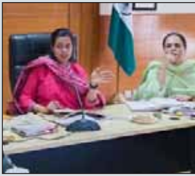
DC directs revenue officials to settle pending mutation cases by May 31