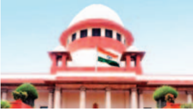
Mills case of 1980, declared two provisions of the 42nd Amendment, which prevented any constitutional amendment from being

"called in question in any court on any ground" and accorded precedence to the Directive Principles of State Policy over the fundamental rights of individuals, as unconstitutional.