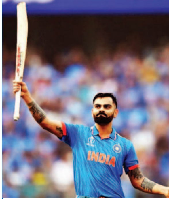
Batting superstar Virat Kohli hit his 51st ODI hundred. Kohli achieved the feat during India's Champions Trophy 2025 fixture against rivals Pakistan in Dubai on Sunday. The century helped India win the clash by 6 wickets.